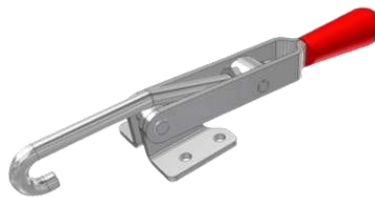
Part Number: RD-35-0001

A medium duty latch clamp suitable to be used for VRTM tooling.