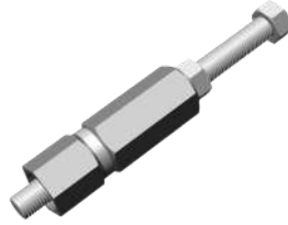
Part Number: XA-0300

Heavy duty machined clamp dowel location set for RTM tooling. This set features a shimmed male cone as well as an M24 bolt, allowing 'Z' stop adjustment.