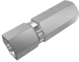
Part Number: XA-0303

Heavy duty machined steel clamp dowel location set for RTM tooling.