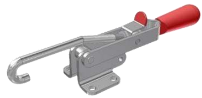
Part Number: RD-35-0003

A heavy duty latch clamp suitable to be used for VRTM tooling.