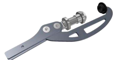
Part Number: XA-0301

Fast action, heavy duty toggle clamp system.