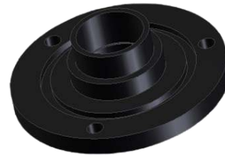
Part Number: XA-0017

20 mm machined steel insert designed to be bolted to metal moulds. This versatile insert accepts pipe inserts to connect to the following: