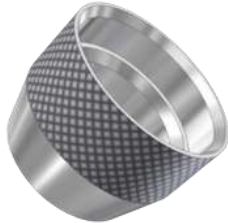
Part Number: XA-0014

20 mm machined steel insert designed to be laminated into composite moulds. This versatile insert accepts pipe inserts to connect the following: